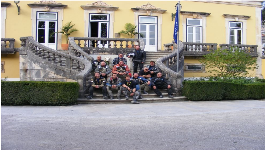
Meet new friends, stay at great hotels