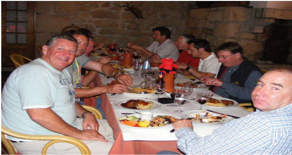
Evenings of food and fun